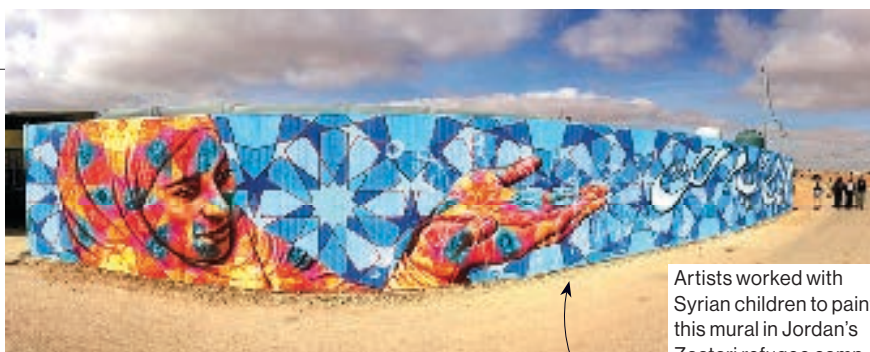
Artists worked with Syrian children to paint this mural in Jordan's Zaatari refugee camp.